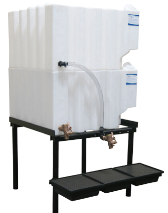
T70-2 Stack shown with stand, drip tray, and gravity feed system